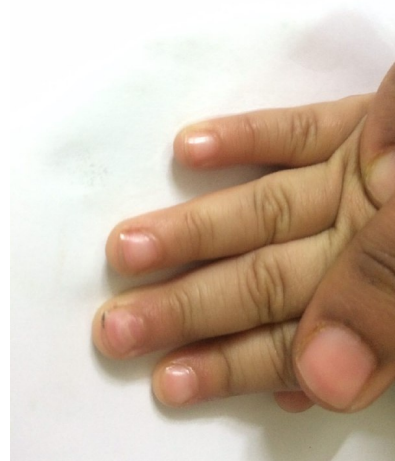
Figure 3: Onychomadesis in hand following hand-foot-mouth disease (HFMD) in a 14 month-old girl.