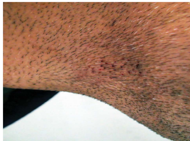
Figure 1 transplanting beard donor hair.

In all the patients, the transplanted hair growth was observed over the localized area of healed suture wound and the scar was less visible in comparison to the remaining suture wound (both due to hair growth in the scar and less erythema in the suture scar) ( Figure 3 ). There was no change in the colour, curl or caliber of the transplanted beard hair. They transplanted beard donor hair maintained the same characteristics as in their original location [2]