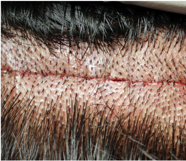
Figure 2 sutured donor wound.